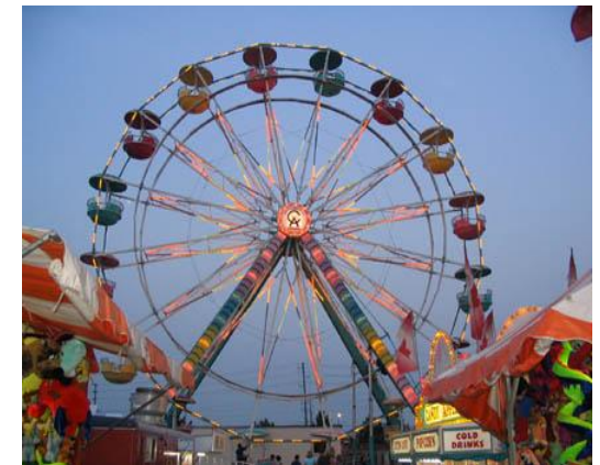
Celebrating 157 Years!

199 Essa Road-Barrie Mon-Fri 9am-4pm (705) 737-3670